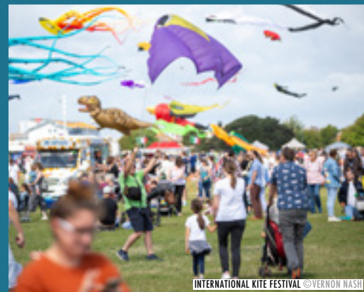
INTERNATIONAL KITE FESTIVAL