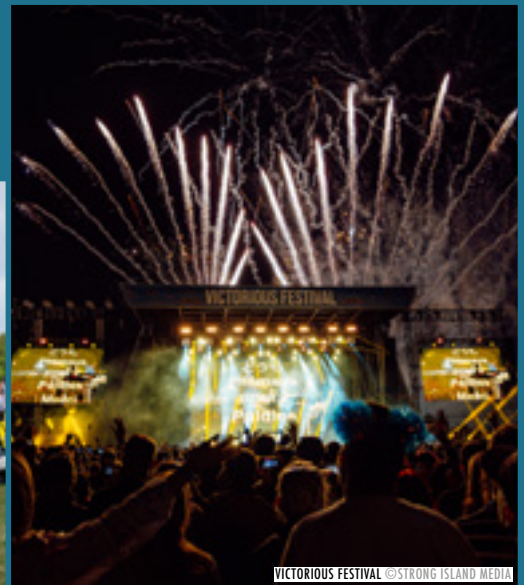
VICTORIOUS FESTIVAL