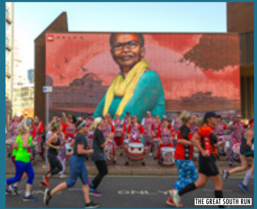
THE GREAT SOUTH RUN

Portsmouth has a year-round calendar of events including Bookfest and Guildhall Games Fest in February, Comic Con in May, D-Day Commemorations, Armed Forces Day and Pride in June, International Kite Festival and Sail GP in July, The Ocean Race and Victorious Festival in August and the Great South Run in October. The year ends with a whole host of seasonal entertainment in November and December. For the most up to date information on all events go to visitportsmouth.co.uk