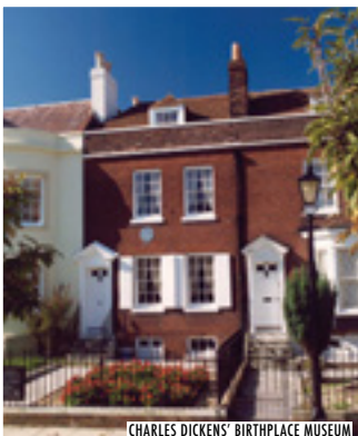
CHARLES DICKENS' BIRTHPLACE MUSEUM