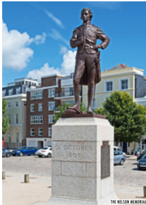
THE NELSON MEMORIAL