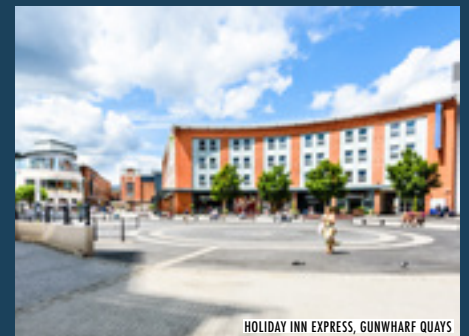
HOLIDAY INN EXPRESS, GUNWHARF QUAYS

For details on these and more group accommodation offers go to visitportsmouth.co.uk/accommodation