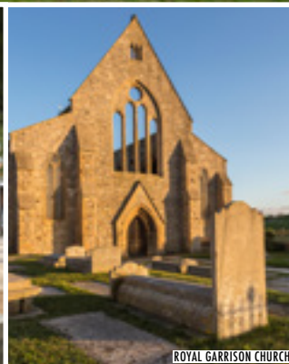
ROYAL GARRISON CHURCH