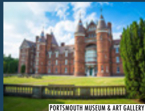
PORTSMOUTH MUSEUM & ART GALLERY