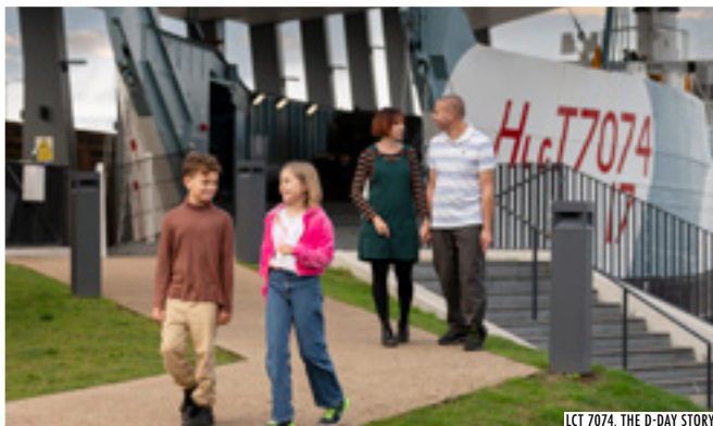
LCT 7074, THE D-DAY STORY